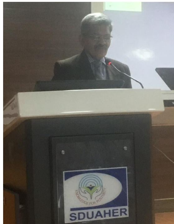
4.) Honorable vice chancellor sharing his personal anecdote