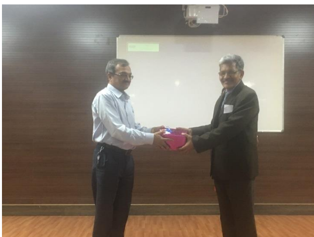
5.) Honorable vice chancellor giving away the memento to our guest speaker