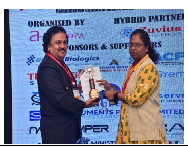
Alexander Fleming Memorial Award for Paper presentation at 6<sup>th</sup> World Congress on Drug Discovery and Development -2022